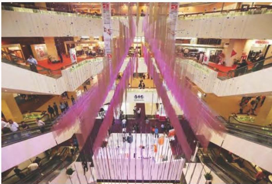
MIFF 2017 will take place at Putra World Trade Centre (PWTC) and MATRADE Exhibition and Convention Centre (MECC).

Less than two months away, Malaysian International Furniture Fair (MIFF) 2017, scheduled March 8-11 and organized by UBM Malaysia, is set to impress visitors and buyers with a greater variety of new and innovative products by furniture suppliers from all over the world.