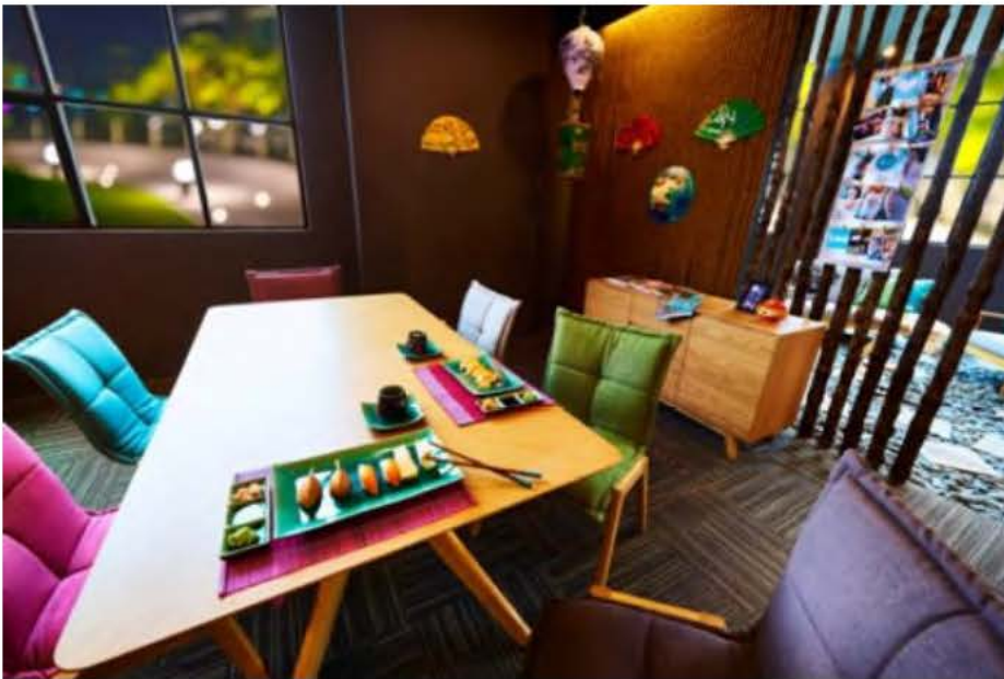
MIFF 2017 will feature a greater variety of innovative and new furniture.