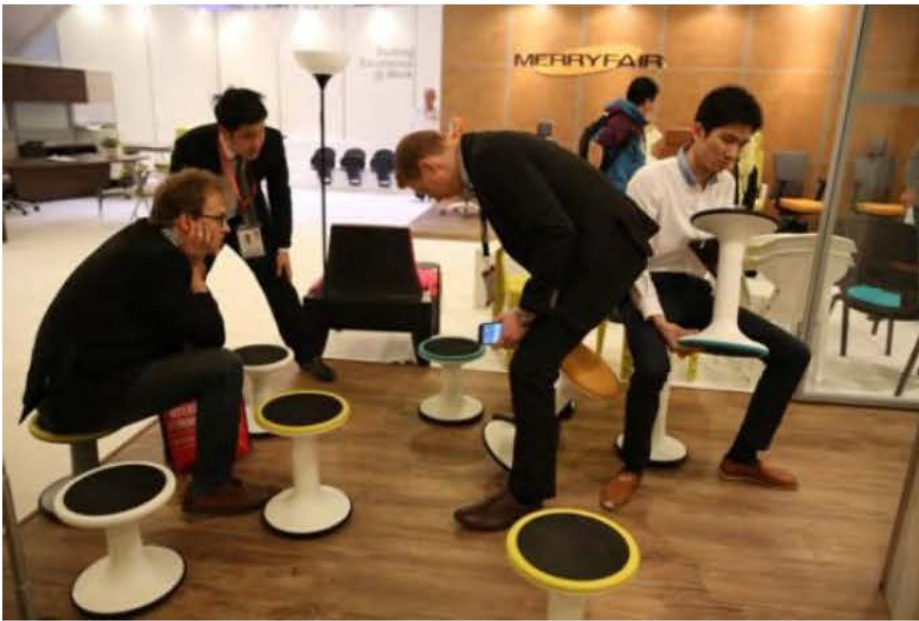
MIFF 2016 resulted in on-spot and post-show sales of some US$900 million between exhibitors and buyers.